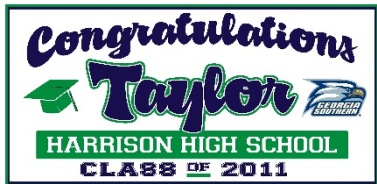
A: No Photo